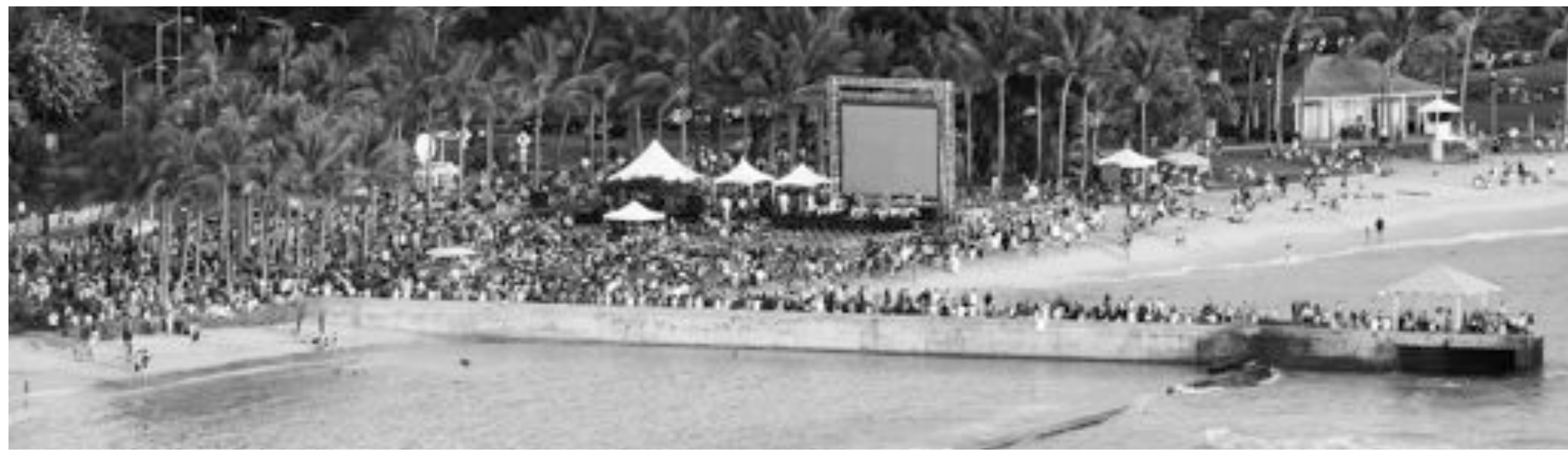
A crowd estimated at 10,000 gathered at Queen's Surf, stretching out along the Kapahulu groin to watch an evening memorial concert celebrating Don Ho's legacy.