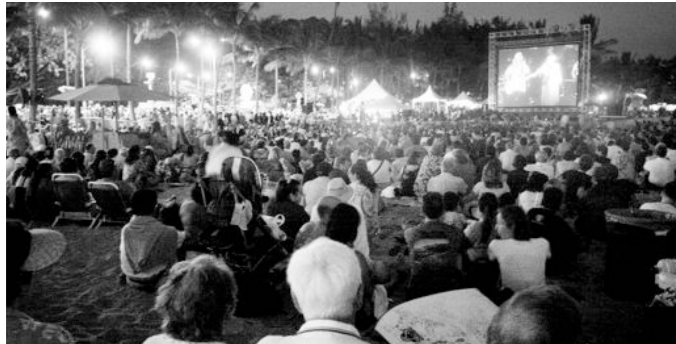
Thousands gathered on the sand before the giant screen at Queen's Surf for the concert. The music began as the sun was setting and continued until past 9 p.m.